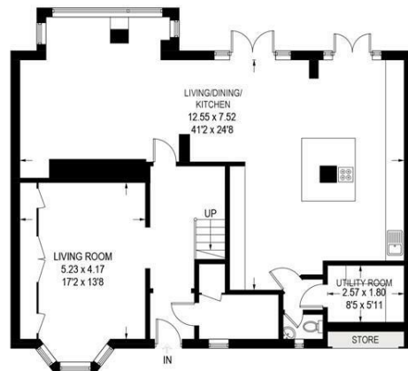
GROUND FLOOR = 120.3 SQ M / 1295 SQ FT

APPROXIMATE GROSS INTERNAL AREA = 302.7 SQ M / 3258 SQ FT