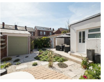
Offers Around £395,000