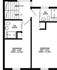
2ND FLOOR 382 sq.ft. (35.3 sq.m.) approx.