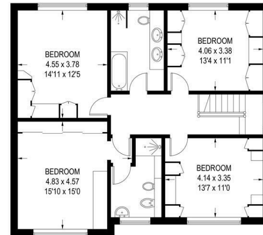
FIRST FLOOR 92.9 SQ M / 1000 SQ FT

Illustration for identification purposes only, measurements are approximate, not to scale.