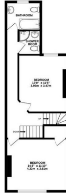
1ST FLOOR CEILING HEIGHT 2.0 M 103 SQ FT (9.5 SQ M) APPROX.