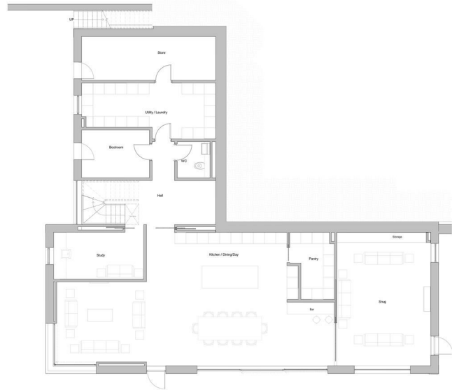
Lower Ground Floor Plan 1:50

Copyright © 2018 All drawings are the property of the architect and shall remain the property of the architect. No part of this drawing may be reproduced, stored in a retrieval system, or transmitted in any form or by any means, electronic, mechanical, photocopying, recording, or by any information storage and retrieval system, without the prior written permission of the architect.