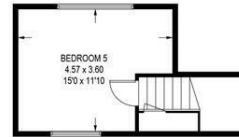
SECOND FLOOR 19.9 SQ M / 214.2 SQ FT