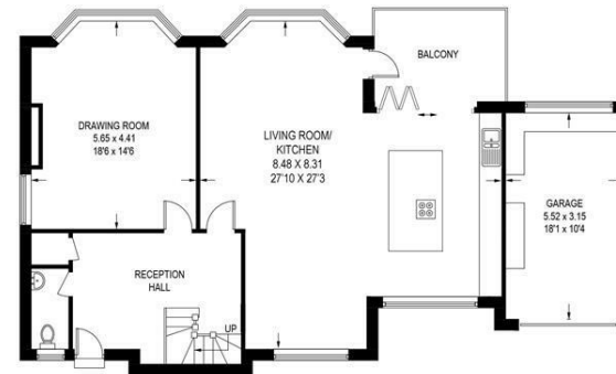
GROUND FLOOR 110.0 SQ M / 1183.9 SQ FT

Illustration for identification purposes only, measurements are approximate, not to scale.