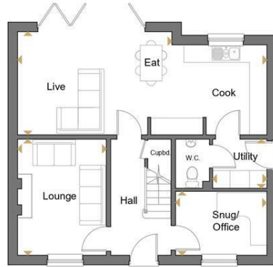
Ground Floor 64 sq.m. 689 sq.f.