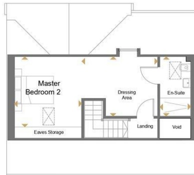
Second Floor 30 sq.m. 323 sq.f.