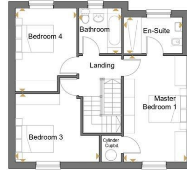
First Floor 64 sq.m. 689 sq.f.