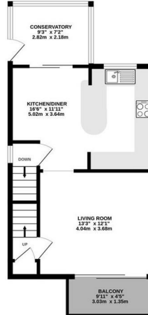
1ST FLOOR CEILING HEIGHT 2.34 M 460 sq ft. (42.8 sq.m.) approx.