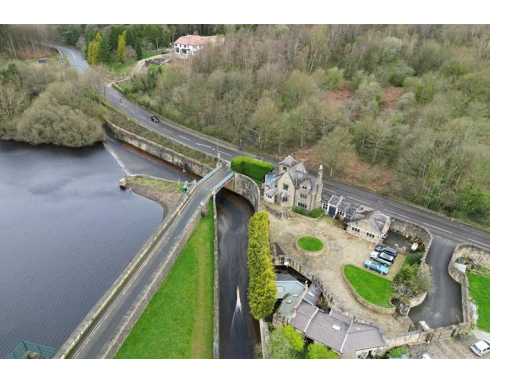
Offers Around £1,095,000