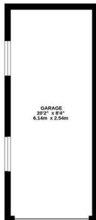
GARAGE 168 sq.ft. (15.6 sq.m.) approx.