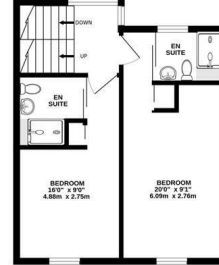
2ND FLOOR 382 sq.ft. (35.3 sq.m.) approx.