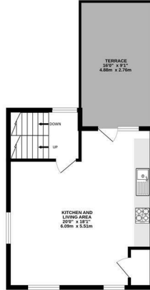
1ST FLOOR 382 sq.ft. (35.3 sq.m.) approx.