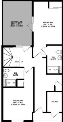
GROUND FLOOR 535 sq.ft. (49.3 sq.m.) approx.