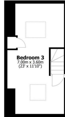
Second Floor Approx. 25.2 sq. metres (270.9 sq. feet)

Total area: approx. 86.9 sq. metres (935.1 sq. feet)